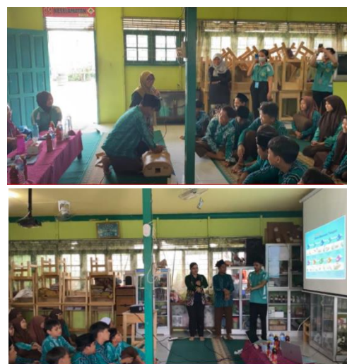
Figure 3. First Activity: PHBS and Basic Life Support Training

After the pre-test process, the team conducted several health counseling and training sessions on Basic Life Support (BLS) to provide information on handling school accidents, as well as on PHBS (Clean and Healthy Living Behavior). These activities were guided by trained instructors. This training is expected to help the cadres fully understand and master UKS services independently. This core group will then carry out further training at SMP Nahdlatul Ulama. After receiving theoretical knowledge, the partners were given the opportunity to practice directly. Practical exercises, such as proper handwashing techniques and how to assist a fainting patient, were conducted in rotation.