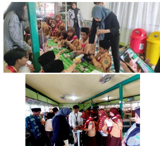
Figure 4. Implementation of Counseling on the Three Major Sins and Basic Health Checkup Training

pressure, as well as providing basic health counseling to their peers. During this event, the cadres performed their tasks exceptionally well. They were able to conduct blood pressure measurements, as well as height and weight assessments, using the available equipment. Approximately 60 students attended, and they appeared enthusiastic about participating in this activity.