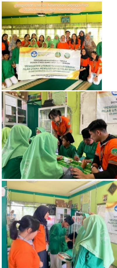
Figure 5. Implementation of Student Health Checkups by the Cadres

provide UKS services in support of government programs aimed at achieving healthy schools.