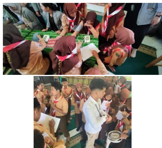
Figure 7. Evaluation Process in the Use of Blood Pressure Monitor and Height Measuring Tool

The overall improvement in knowledge and skills among the cadres is expected to serve as a primary asset in supporting a healthy school at SMPN NU Banjarmasin. Additionally, the cadres who have acquired these skills can share their knowledge with other student peers.