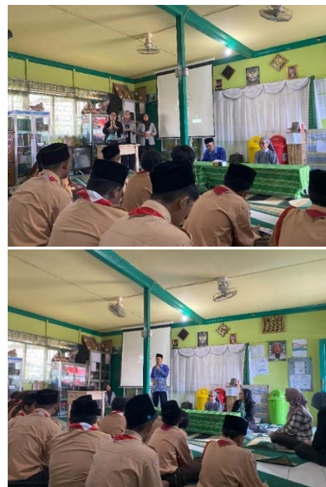
Figure 1. Dissemination about the Activities to be Conducted with Partners

resource persons. The event was attended by the principal, the Community Service Team, UKS mentors, and UKS cadres who participated well in the program. On the same day, there was also a counseling session on clean and healthy living behaviors (PHBS) and first aid for accidents (P3K). This training is a follow-up from the previous dissemination activity. The training was conducted through classroom lectures accompanied by video-based learning methods that are easier for partners and UKS cadres to understand. The activities also included hands-on practice using various tools.