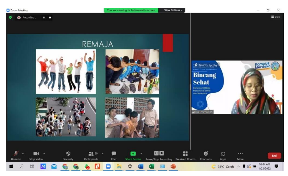
Figure 3. Educational process regarding Adolescent Reproductive Health