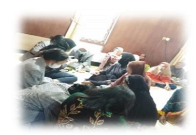
Figure 6. Blood pressure check activities

elderly gymnastics went very well and up to 40 elderly participated in the activity. The team was assisted by several students who had previously learnt the movements of the elderly gymnastics. The team also checked the blood pressure of the elderly.