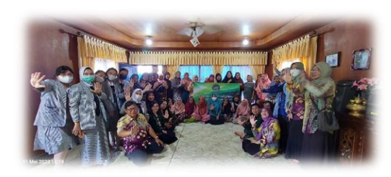
Figure 2. With cadres during training

This session aimed to provide a detailed explanation of the purposes and advantages of gerontic care, as well as to instructions on care training materials. Training modules were distributed during this session, which was attended by the Head of Neighbourhood, Community Service Team and Posbindu Cadres. Gerontic Care Training follows on from the socialisation activities which were conducted during the preparation The training involves direct phase. practical experience in the field. After receiving the theoretical module, partners are required to immediately apply gerontic care practices. Instructors, who have received gerontic care training, will supervise and guide this activity. This training was expected to be carried out comprehensively and continuously to ensure that partner communities really understand and master gerontic care independently and this group is a parent or core group which will then conduct cadres in their respective areas. The cadres will also be given training and introduction to the DIARII Hypertension Programme to add information on the latest hypertension management.