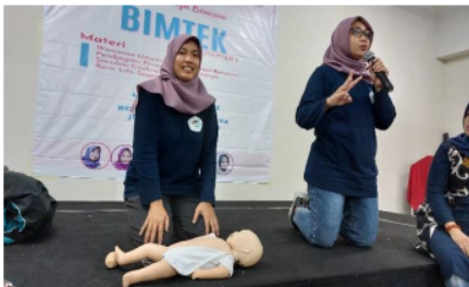
Figure 3. Training of CPR for baby