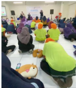
Figure 4. Training of CPR for adult

Training is one of the activities efforts that can increase knowledge and skills, Female volunteer of Srikandi need upgrade of capacity with skill and training. Basic life support education for women when a disaster occurs is very important, because women are a vulnerable group during a disaster due to the lack of access to disaster response knowledge provided to women. Disaster response organizations, which distort gender equality against women, appear as possible factors of harm for women.