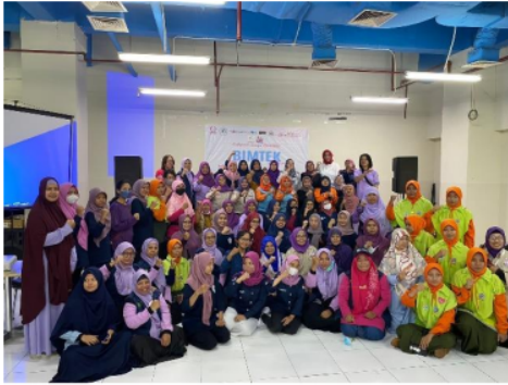
Figure 1. Woman volunteer of Srikandi, East Java Training Activities